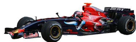
Toro Rosso STR2 - Ferrari 056

Locorotondo 1'78 m - 68 kg - 6/8/80 22 GP - 8é - 11é - S