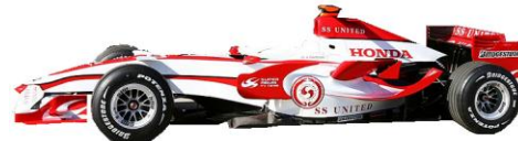
Aguri SA07 - Honda RA806E Sakon Yamamoto (J)

東京 (Tokyo) 1'64 m - 59 kg - 28/1/77 69 GP - 3r - 2n - C1