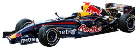
Red Bull RB3 - Renault RS26 R. Doornbos (NL) - Michael Ammermüller (D)

Twynholm 1'82 m - 74 kg - 27/3/71 211 GP - 13 - 12 - S