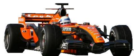
Spyker F8-VII - Toyota RVX06 Winkelhock (D), Vallés (E), Fauzy (MY), v.d. Garde

Eindhoven 1'76 m - 68 kg - 16/4/79 37 GP - 5é - 13é - C